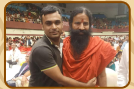
With Swami Ramdev Ji