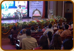
Speech On Yoga & Ayurveda