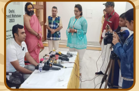
Press Conference On Yoga & Ayurveda