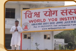
World Yoga Institute