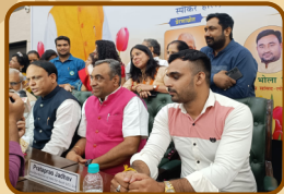
International Natureropathy Org. (Press Confrence)