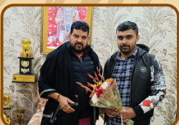
With Brij Bhushan Sharan Singh (Ex. Wrestling President of India)