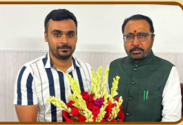
With A.Y.U.S.H. Minister of (HEALTH & FAMILY WELFARE) PRATAPRAO JADHAV