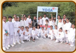
World Yoga Institute