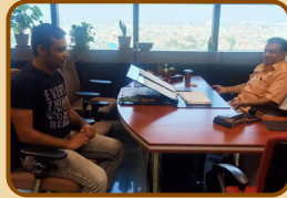
Meet With Director (A.Y.U.S.H)