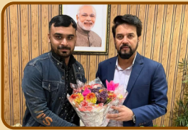
With Sports Minister ANURAG THAKUR